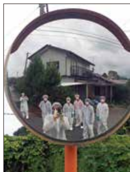
Don't Follow the Wind Curatorial collective on a site visit in the Fukushima exclusion zone

Exhibition inaugurated on March 11, 2015 at locations within the restricted Fukushima exclusion zone