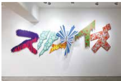
THREE SIZE, 2002

Born 1964 in Tokyo, Japan Lives and works in Tokyo, Japan