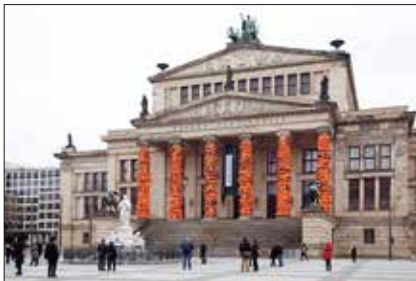
Safe Passage , 2016 © Ai Weiwei Studio

Born 1957 in Beijing, China Lives and works in Berlin, Germany