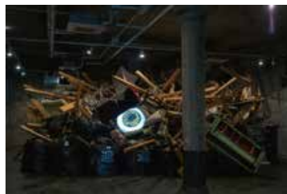
Project God-zilla — Landscape with an Eye —, 2016

Born 1959 in Fukuoka, Japan Lives and works in Onomichi, Japan