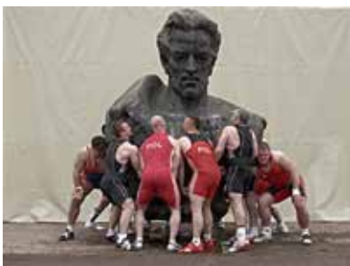
Heavy Weight History, 2013

Born 1968 in Göttingen, Germany Lives and works in Berlin, Germany