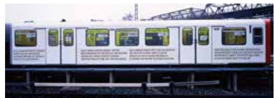
from Truisms, 1977-79 Hamburg, Germany, 1987 © 1987 Jenny Holzer, member Artists Rights Society (ARS), NY

Born 1950 in Gallipolis (OH), U.S.A. Lives and works in New York, U.S.A.