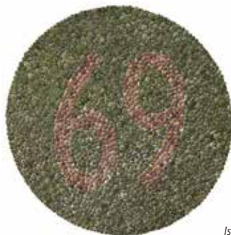
Island For the Colorblind, 2014

Established in 1996, Based in Chai Wan, Hong Kong Laurent GUTIERREZ / Born 1966 in Casablanca, Morocco Valérie PORTEFAIX / Born 1969 in Saint-Étienne, France