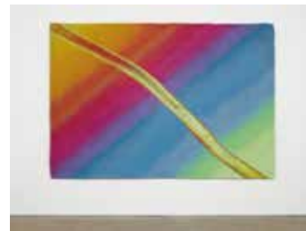
Trace fiber from Freud's couch under crossed polars with Quartz wedge compensator, 2015