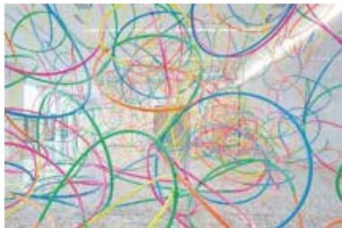
untitled(hula-hoop) (2005-2015)

Third in an art program series organized by YCC Yokohama Creative City Center.