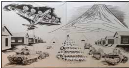
Human Mt. Fuji, 2017

Born 1972 in Tokyo, Japan Lives and works in Tokyo, Japan