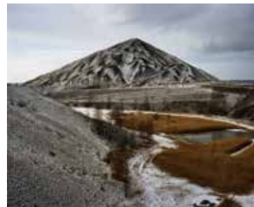
Terril #16931, 2010, Loos-en-Gohelle

Born 1958 in Rikuzentakata, Japan Lives and works in Tokyo, Japan