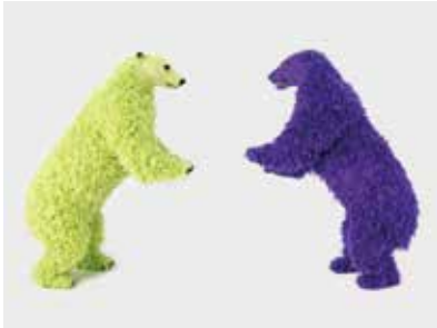
I and I (must stand for the art) , 2014

Lives and works in Anchorage (AK), U.S.A.