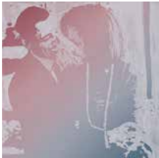
The Obama Paintings , 2009 - 2017

Courtesy of the artist and Gavin Brown's enterprise, New York/Rome.