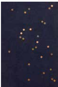
Dream Maps, Polaris (detail), 2016 Courtesy of the artist and Blum & Poe, Los Angeles, Tokyo, New York

Born 1961 in Seattle (WA), U.S.A. Lives and works in Santa Monica (CA), U.S.A.