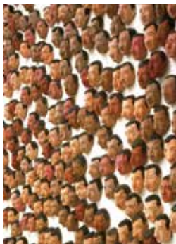
Spermini, 1997

Born 1960 in Padua, Italy Lives and works in Milan, Italy and New York, U.S.A.