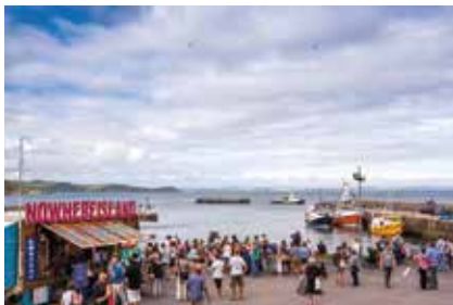
Nowhere Island visits Mevagissey, 2012

Born 1963 in London, U.K. Lives and works in Devon, U.K.