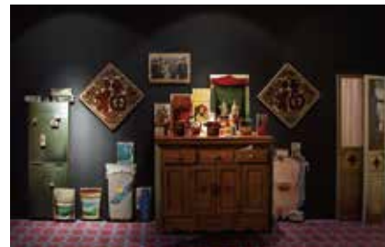
Grandmother's House - gods , 2013 Courtesy: DONG Yuan

Born 1984 in Dalian, China Lives and works in Sanhe, China