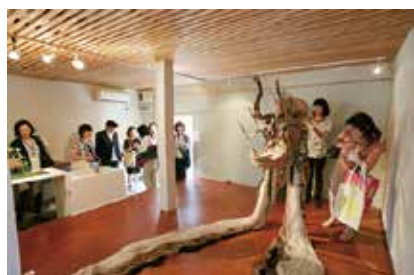
Koganecho Bazaar 2016