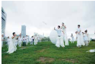
Yokohama Paratriennale 2014

Yokohama Paratriennale aims at realizing a symbiotic society where artists work on creative activities in creating opportunities for people with disabilities to engage in social activities, and fostering a society that is tolerant and open to diversity.