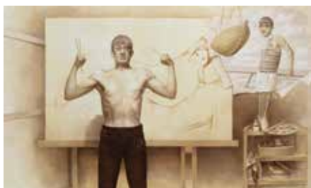
The Return of Painter F (detail), 2015 Painting by TROTART (Acho Karisma, Sobrin) Collection of Mori Art Museum

Born 1965 in Tokyo, Japan Lives and works in Saitama, Japan