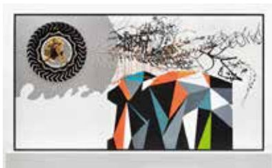
Jitterbugs Tangofly Tagplants, 2016 Produced at STPI – Creative Workshop & Gallery, Singapore

Carsten HÖLLER / Born 1961 in Belgium Tobias REHBERGER / Born 1966 in Germany Anri SALA / Born 1974 in Albania Rirkrit TIRAVANIJA / Born 1961 in Argentina