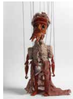
Cabaret Crusades III: The Secrets of Karbalaa (Marionette), 2015