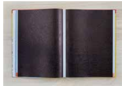
Atlas 25 LISBOA-BADAJOS , 2016