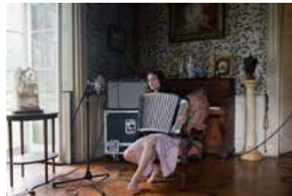
The Visitors, 2012 Nine channel video projection Courtesy of the artist, Luhring Augustine, New York and i8 Gallery, Reykjavik

Born 1976 in Reykjavík, Iceland Lives and works in Reykjavík, Iceland