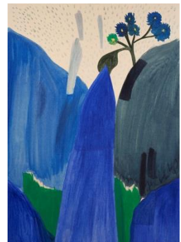
《Blue Crystal》 2014