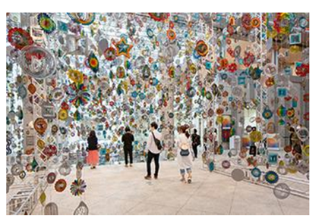
7th Yokohama Triennale (2020) Nick CAVE, Kinetic Spinner Forest , 2016 (recreated in 2020), © Nick Cave