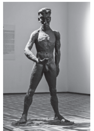
5 KP Krishnakumar's work