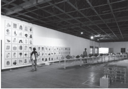
72 Privileges by Joseph Semah 10