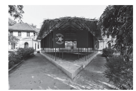
New World Summit by Jonas Staal З