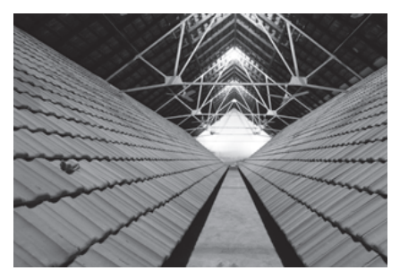
Veni Vidi Vici by LN Tallur 9