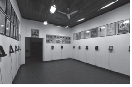
Varavazhi Project 7