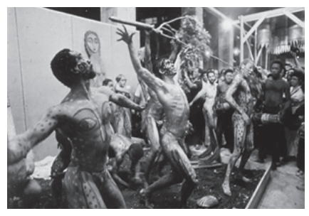
Manuel Mendive, Cuba, 2nd Havana Biennial

For 1991, which was the fourth Biennial of Havana, the theme was "Challenger of Colonization."<sup>2</sup> It fluctuated between the significance of colonialism and neo-colonialism, by not only studying the contents of our societies and cultures, but also the languages and instruments that drive the present time. Together with "The Challenge of Art" section that exposed the work of over 200 artists, several shows were organized and they underlined, from the perspective of art, the heterogeneous range of questions and answers of the creators in different contexts. This edition introduced, for the first time, and on a large scale, architecture as another important form that configure the visual environment of our cultures. A section was dedicated to the work of some of the masters of contemporary Latin American architecture. It is important to mention that in this edition, the Havana Biennial reached out to the areas in Cabaña and Morro, on the other side of the bay in Havana, incorporating relatively new buildings of the City, in addition to the ones that, until then, hosted the event, namely the Historic Center, which also exhibited around dozen magnificent installations.