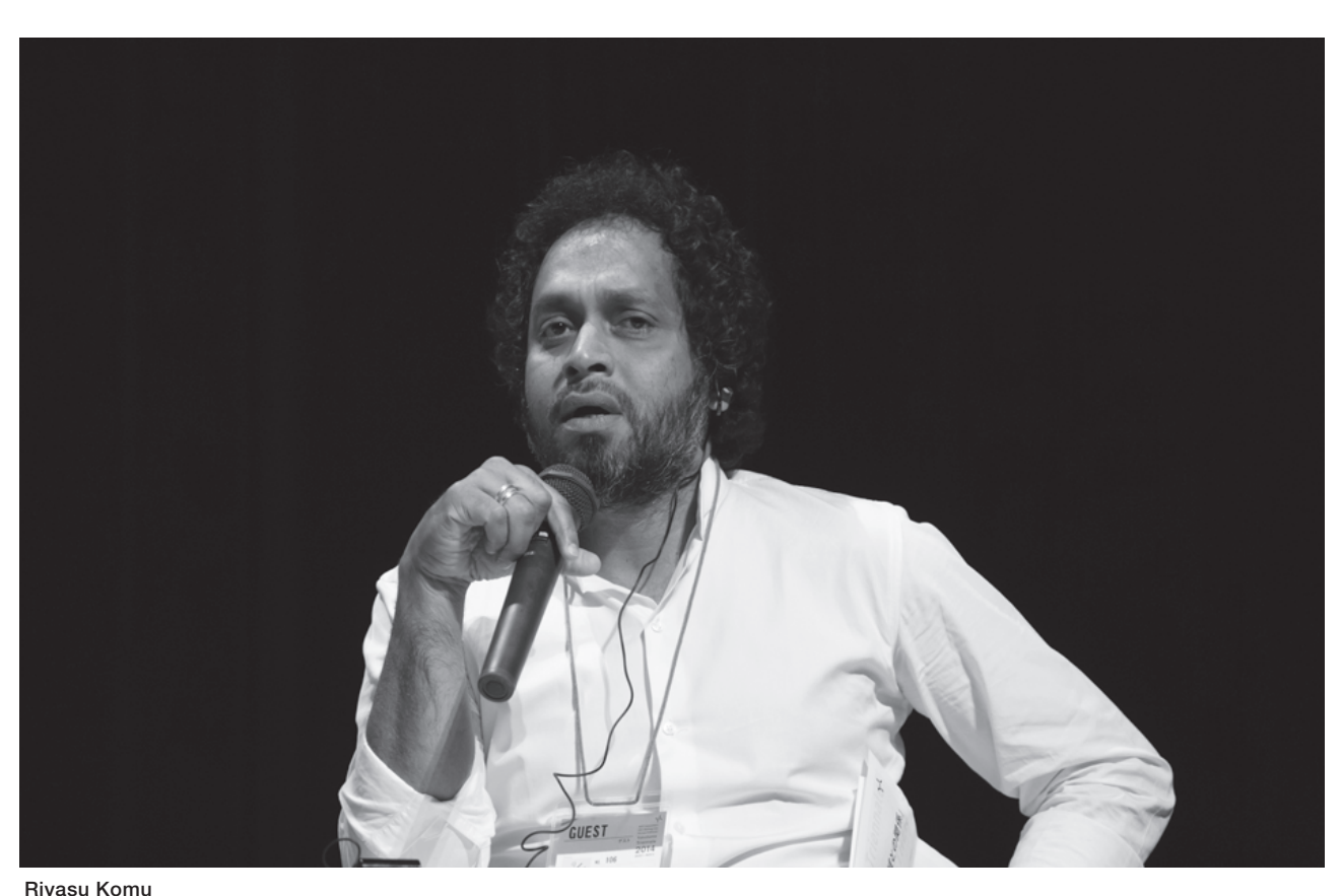
Co-founder of the Kochi Biennale Foundation / Director of Programmes, Kochi-Muziris Biennale 2014

Kochi is actually known as "The Queen of Arabian Sea," and it has always been a center for spice trade. The current city, Kochi, is more than 600 years old, and it has had strong trade relations with several parts of the world. But one of the most important aspects about this Biennale is not just about Kochi; it's about the other legendary predecessor to Kochi, which is Muziris. Muziris is an ancient port city with more than 3,000 years of history. It was a city which used to have trade relations, at that time, with the Romans, the Greeks, the Arabs, and the Chinese. What it has learned through this kind of trade relation is not just the value of trade, but also the