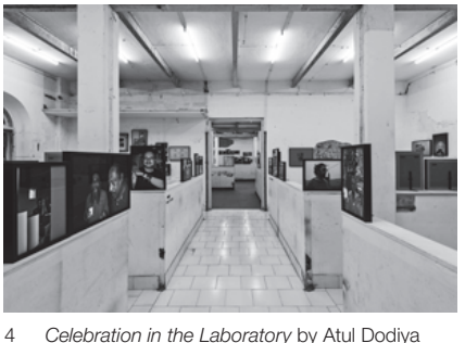
Celebration in the Laboratory by Atul Dodiya